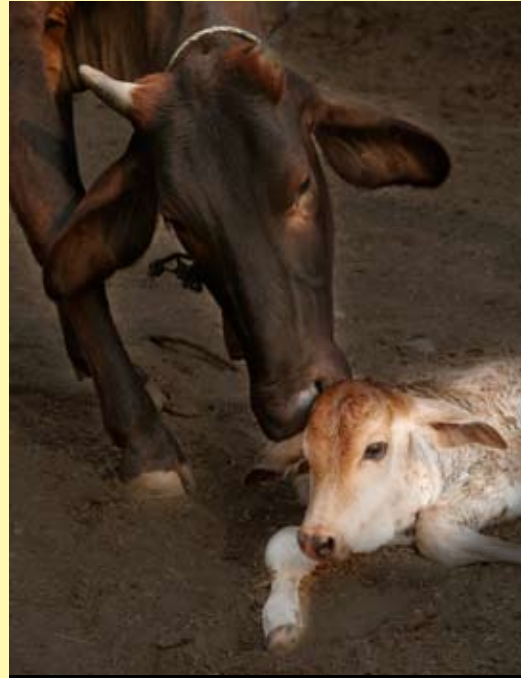
Pushpa with her newborn calf