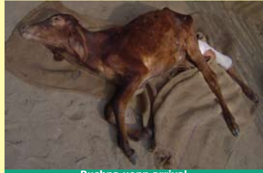
Pushpa upon arrival

lying there. They told me that she wouldn't survive, that she had no will to live...besides her broken leg and displaced hip, she had been torn up a little on her side, and no one was sure if she was internally injured. It turned out she wasn't, but she had a long, long way to go before she recovered. Her tiny little calf spirit had been broken...