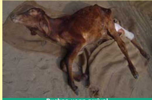
Pushpa upon arrival

lying there. They told me that she wouldn't survive, that she had no will to live...besides her broken leg and displaced hip, she had been torn up a little on her side, and no one was sure if she was internally injured. It turned out she wasn't, but she had a long, long way to go before she recovered. Her tiny little calf spirit had been broken...