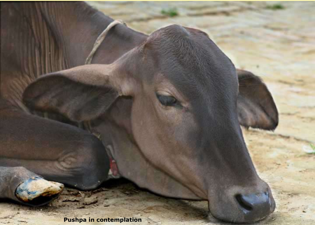
Pushpa in contemplation

The comments were amazing: none of these people were vegetarians that I knew of, bar three of them. But Pushpa still touched their hearts. All of the