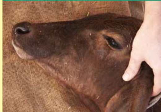
Pushpa was barely alive